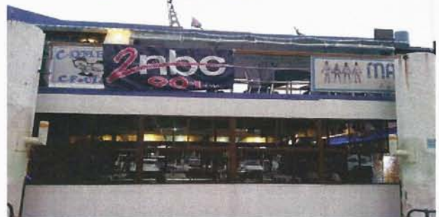
Recently I was invited to a community radio station fundraiser with some of the team at